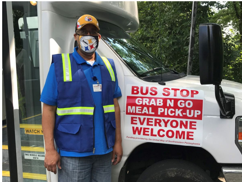
Figure 3: Marked delivery vehicle and driver

Overall, the prototype implementation has been considered successful by all stakeholders. As of early August, over 5000 school meals had been delivered, and it has recently been named as Metro Lab Network’s “Innovation of the Month” for August 2020 ( https://metrolabnetwork.org/projects/innovation-of-the-month/ ). Some pictures of the school lunch delivery program in action are given in Figures 3,4, and 5.