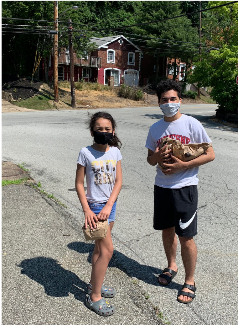
Figure 4: Two students receiving meals

In mid-August, the routes were tweaked slightly in anticipation of the approaching fall school semester, removing 4 stops that received very few customers and replacing them with 4 more promising locations. Current school district plans call for startup with virtual instruction and continuation of the home school meal delivery program through the fall of 2020.